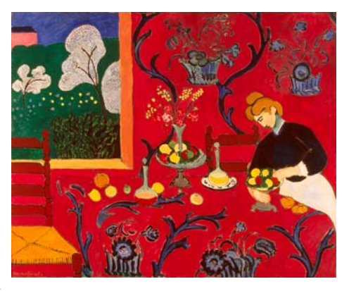
Henri Matisse, The Red Room, 1908

B. Read Chapter 29 - Modernism in Europe and America, pgs 834-897. Focus on the following images and write notes on loose-leaf paper. Draw a small, 60-second sketch of images and don't worry about your drawing skills - it's just to help you remember what each artwork looks like. Art: 29-2, 29-7, 29-11, 29-12, 29-24, 29-35, 29-48, and 29-76.