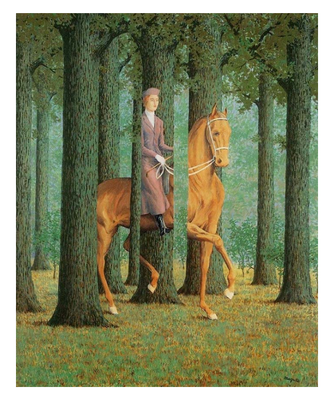
Rene Magritte, Le Blanc Seing, 1965

Before you leave school for the summer be sure come to room A19 and pick up the following materials. If you are not able to do this please email me to make other arrangements.